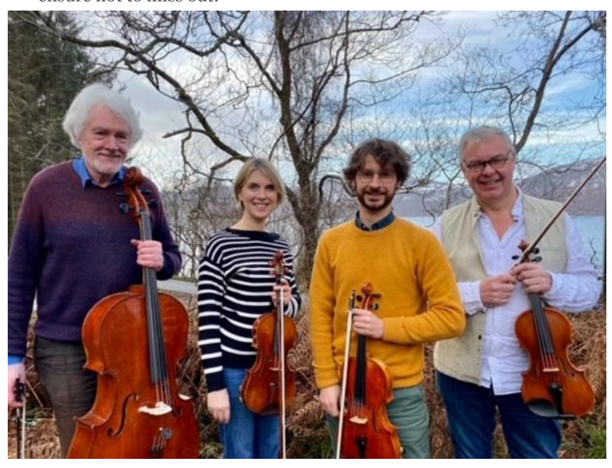
THE AURORA QUARTET, Easter Sunday 17th April at 4pm (doors 3.30pm), Stables.

And don't forget, THE RIOT OF RESOLIS tickets for both performances on Friday 6th May are selling well so get yours now to ensure not to miss out!